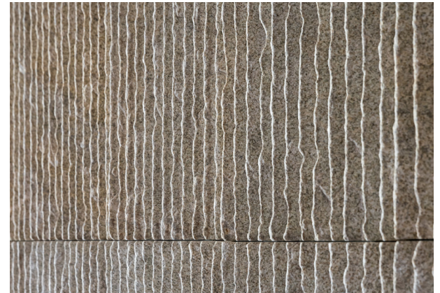
Stone, a traditional hanok material, shaped with a soft, wave-like texture

In parallel, we study materials that harmonize with wood, designing interiors that complement hanok architecture. By pairing stone with timber and marble with wood, we explore new possibilities within the aesthetic of hanok. The beauty of hanok is inherently powerful, capable of overshadowing any interior design. For this reason, we minimized interior elements and concealed functional components, allowing the true essence of hanok to come forward.