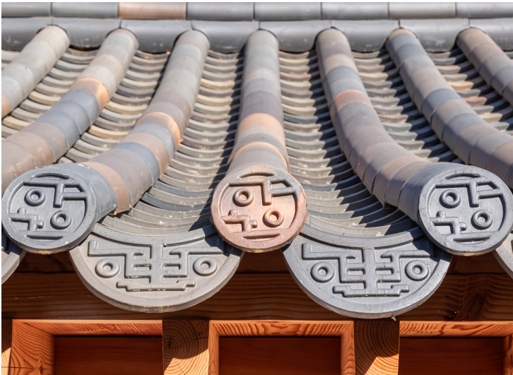
The color of the roof tiles shaped by the firing time and temperature