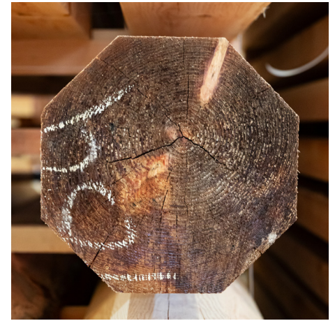
Donghae City Timber Storage Depot: Natural drying in progress