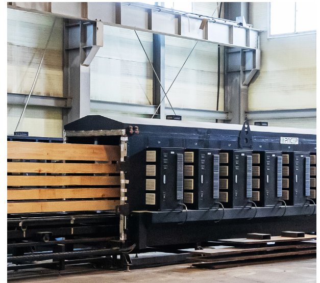
Microwave Drying Technique:

We use data-driven methods to process top-quality timbers, ensuring stability and durability.