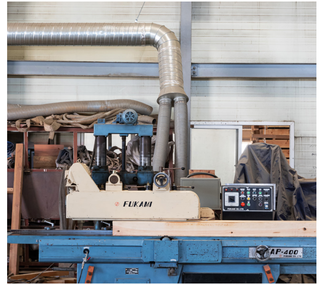
Precise Processing of Premium Large Timbers:

Through this breakthrough, we have set the long-paused evolution of hanok in motion once again.