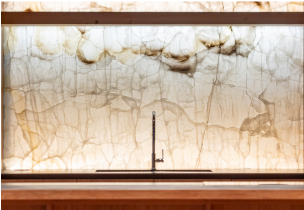
Light-transmitting marble, revealing its naturally formed patterns and textures

In parallel, we study materials that harmonize with wood, designing interiors that complement hanok architecture. By pairing stone with timber and marble with wood, we explore new possibilities within the aesthetic of hanok. The beauty of hanok is inherently powerful, capable of overshadowing any interior design. For this reason, we minimized interior elements and concealed functional components, allowing the true essence of hanok to come forward.