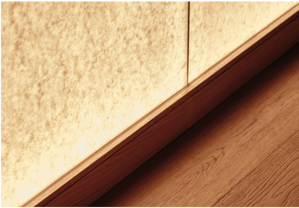
Walls made from durable materials that preserve the texture of traditional Jeonju hanji paper